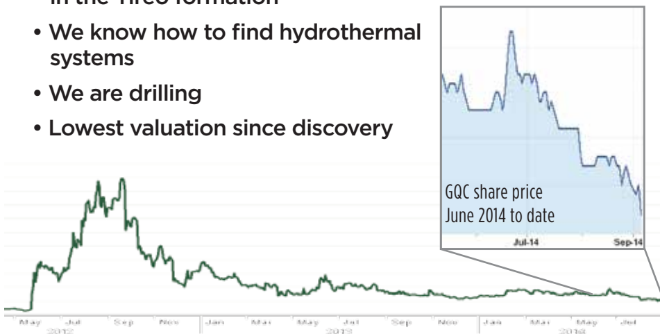
GQC Share Price chart - May 2013 (Discovery) to September 2014